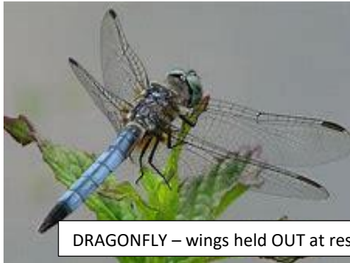
DRAGONFLY – wings held OUT at rest