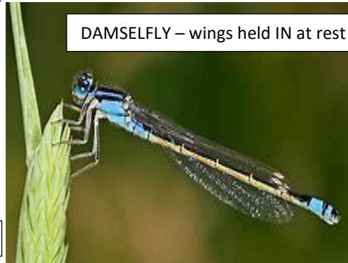
DAMSELFLY – wings held IN at rest