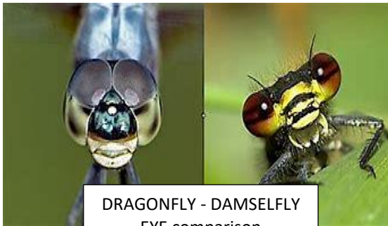
DRAGONFLY - DAMSELFLY EYE comparison