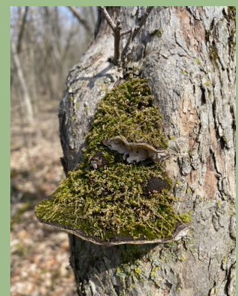
Mossy tree